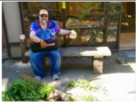
SPRING CLEANUP DAY